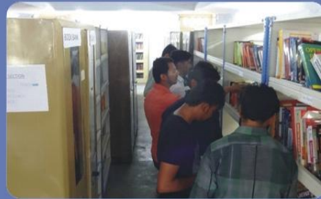
Open Shelf System