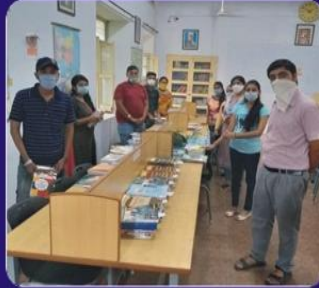
Book-Bank Facility for needy students